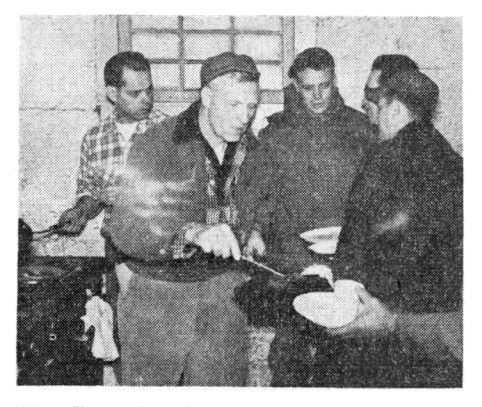
Hot Camp breakfast-eggs and flapjacks

On the camping trip we had lots of fun. When we got to camp, the first thing we did was choose a bunk to sleep in. Then we played some games outside together. After that the boys had a snowball fight. Then we packed down snow and made a launching pad for sleds. Later, we went sledding. After lunch we took a hike to Camp Falcon. We had a short Bible study before supper. After supper we played games, then we went to bed. In the morning we went tobogganing. Everyone thought tobogganing was the best part of the camping trip. After lunch we left for home. We wished that it was longer.